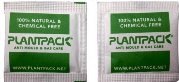
Finished Product (2)