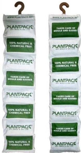
Finished Product (1)